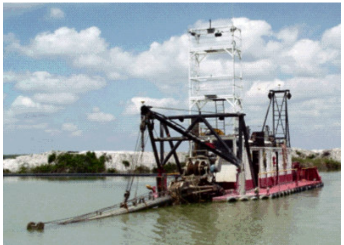
Removing the clay slime by-product resulting from the phosphate mining process

The Bubbler unit provides HYDROpro with the depth of water above the cutterhead. The bubbler unit uses a low volume air pump and sensors to measure the pressure at the end of a hose installed along the